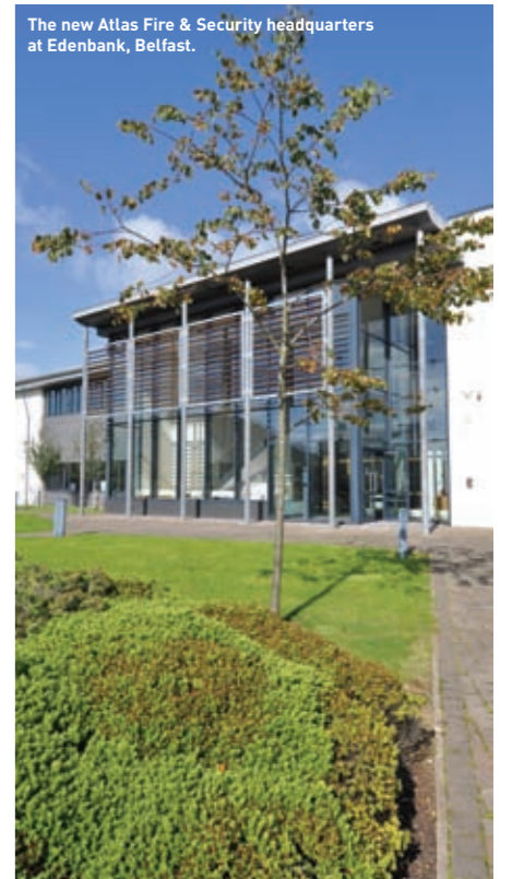
The new Atlas Fire & Security headquarters at Edenbank, Belfast.