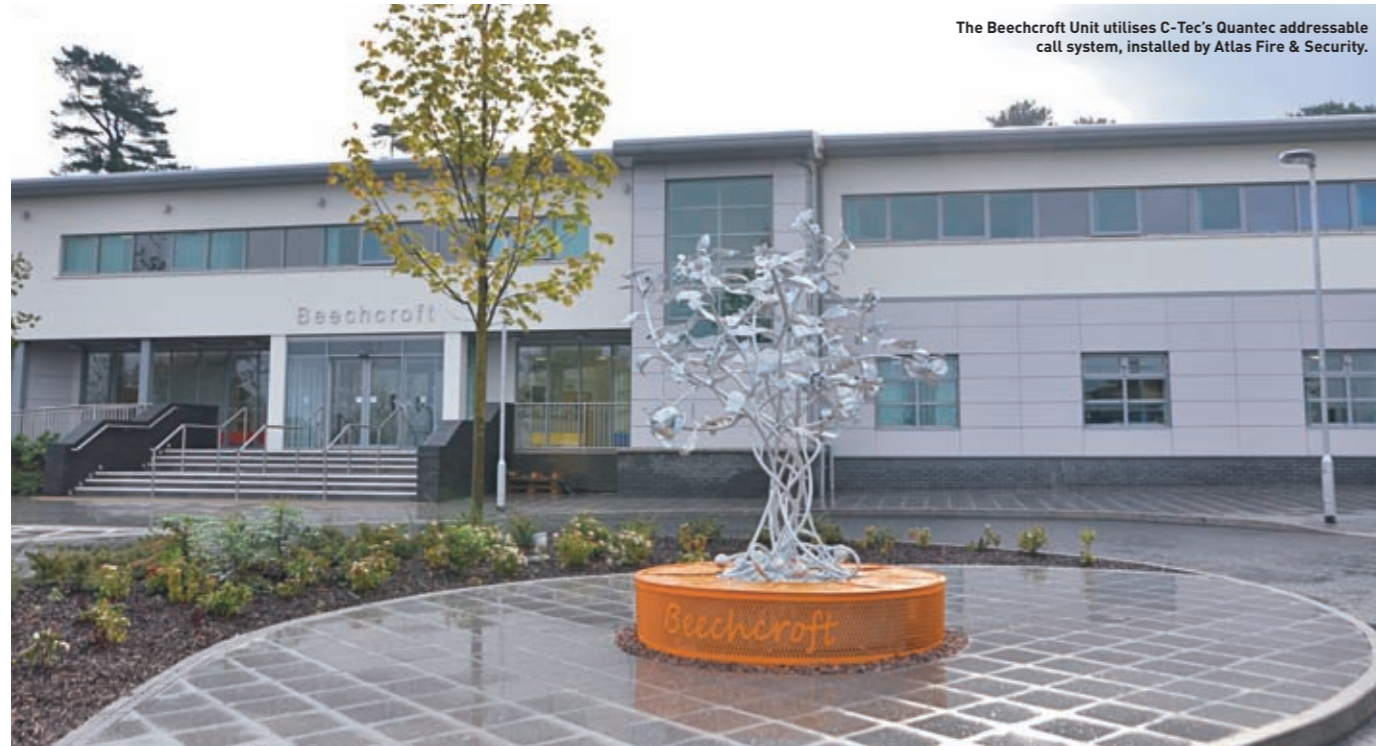
The Beechcroft Unit utilises C-Tec's Quantec addressable call system, installed by Atlas Fire & Security.