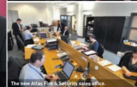
The new Atlas Fire & Security sales office.